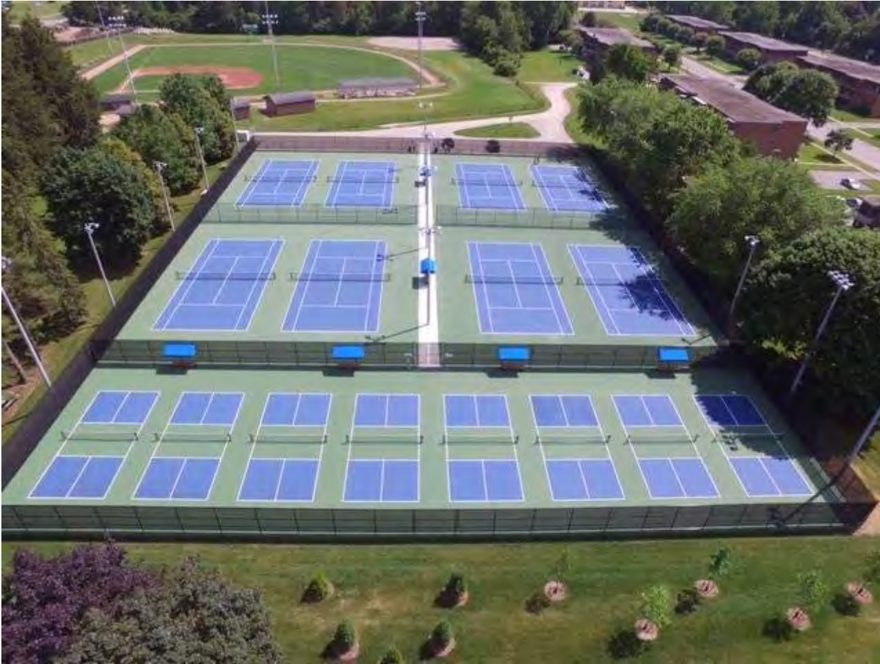
Pinafore Park St. Thomas, Ontario