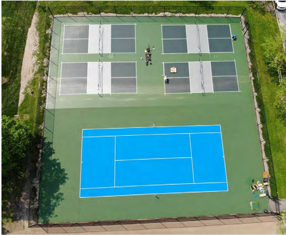
Court Repurposing - Stratford, Ontario