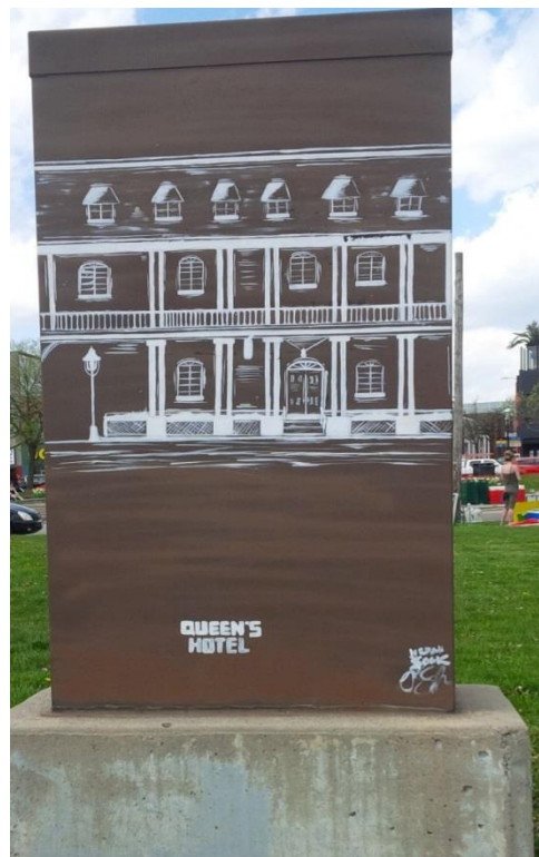
Themed murals on traffic cabinets at Dunlop Street and Owen Street (left) and at Memorial Square (right)