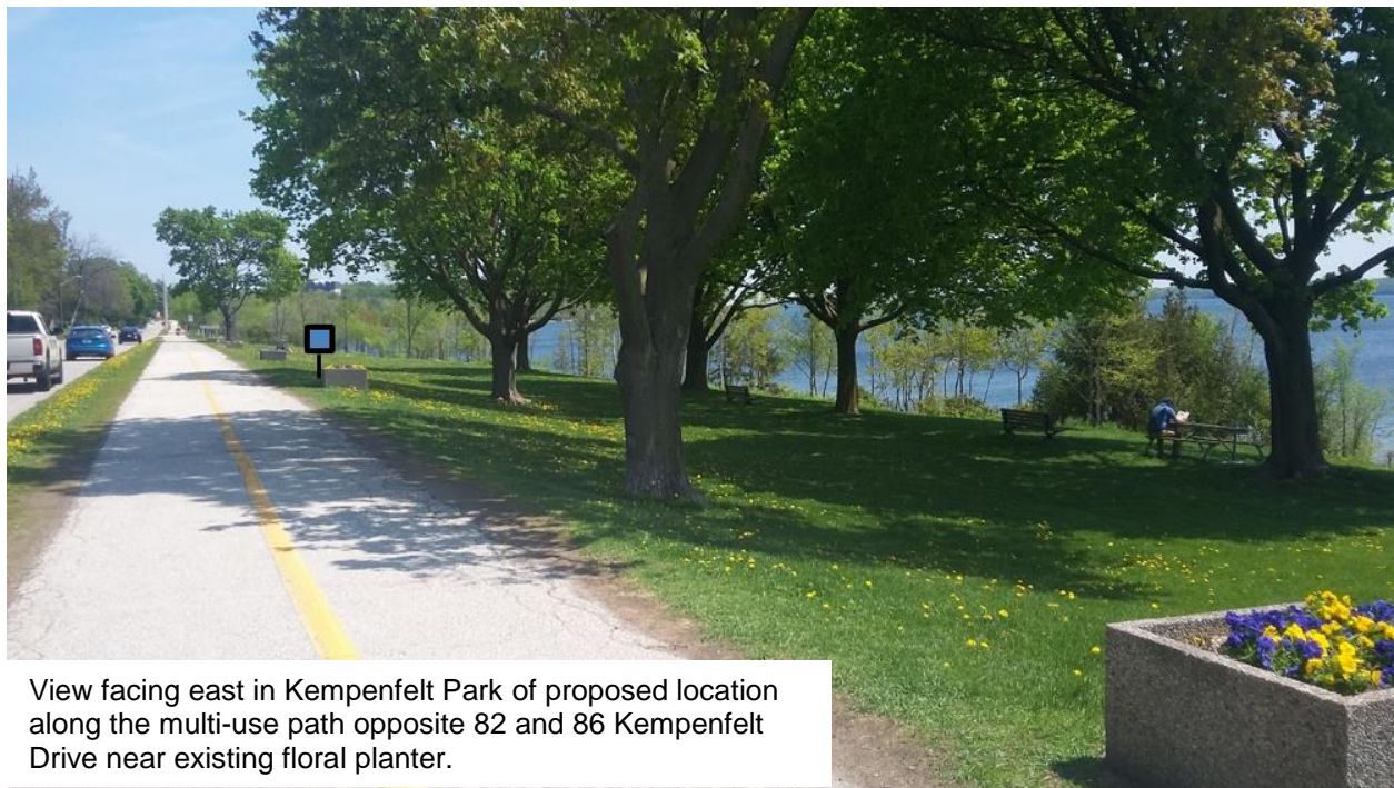
View facing east in Kempenfelt Park of proposed location along the multi-use path opposite 82 and 86 Kempenfelt Drive near existing floral planter.