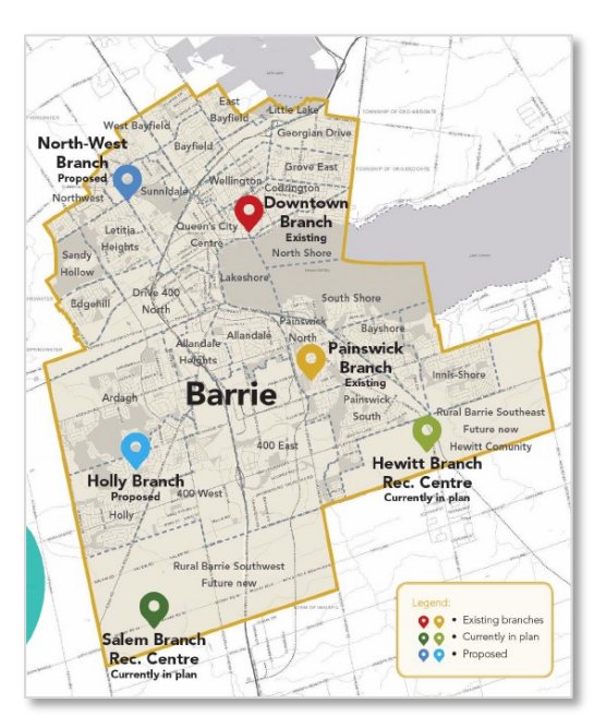
Master Facilities Plan, 2017