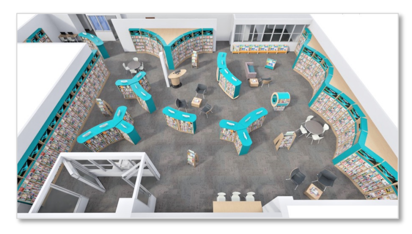
Rendering of Holly Community Library