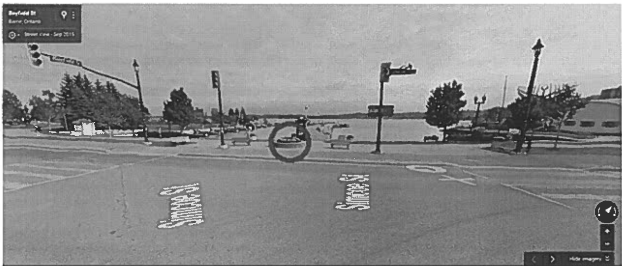
Street view image of proposed post clock location