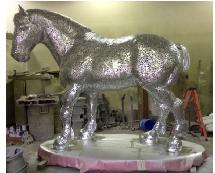
This stainless steel horse is an example of the mirror silver two-part epoxy paint application.

The Stainless Steel Horn Bells: Due to the fact that heat stains occur in the stainless steel welding process and that they can not be polished out (due the small parts and spaces of the welded surface) the bell horns would be sandblasted and painted with a two-part epoxy mirror silver point. It has been my experience that the use of stainless steel, despite this painting requirement guarantees the best substrate for a long life of trouble free maintenance.