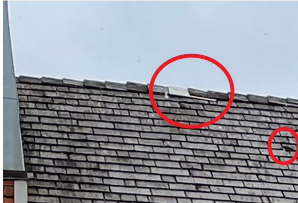
Repairs and signs of wear