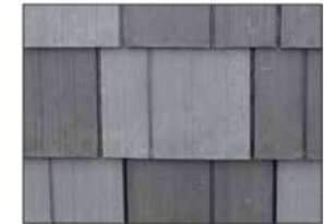
Multi-Tone* (Combination of Silvered Cedar & Aged Cedar)