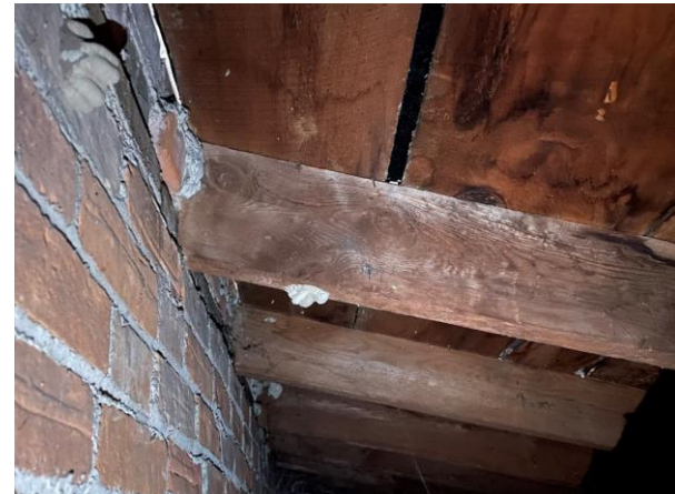
Daylight observed on North Low-roof