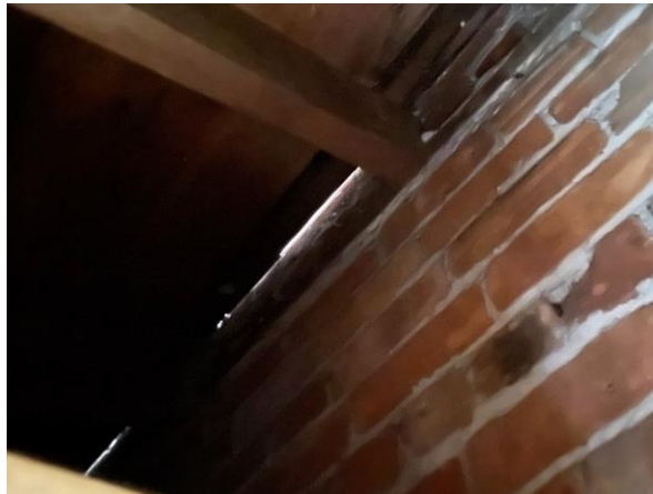
Daylight observed on South Low-roof