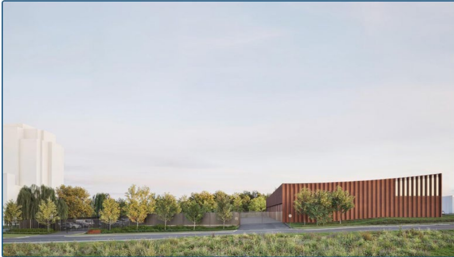
Proposed rendering of the Wastewater Innovation Centre pending Site Plan Approval

it would appear that instead of a facility building, the plan is for a parking lot in the space of the Diner. Surely one would think that this design could have been mitigated and situate the parking lot around the Midway Diner.