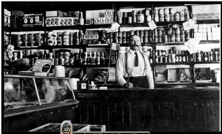
Barrie, ON - J.R. Guest Grocer *Interior View c.1900/10

Vintage Barrie ON *Photographs, Moments & Memories