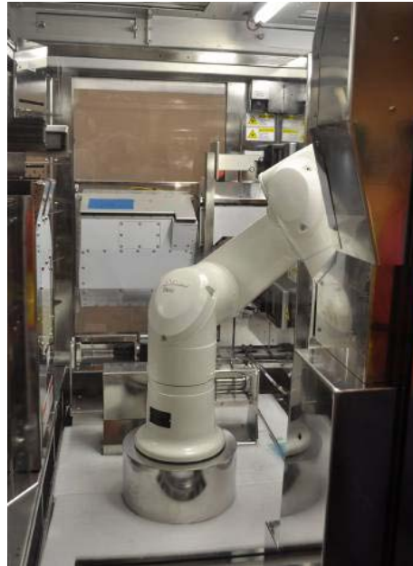
Robotic chemo unit