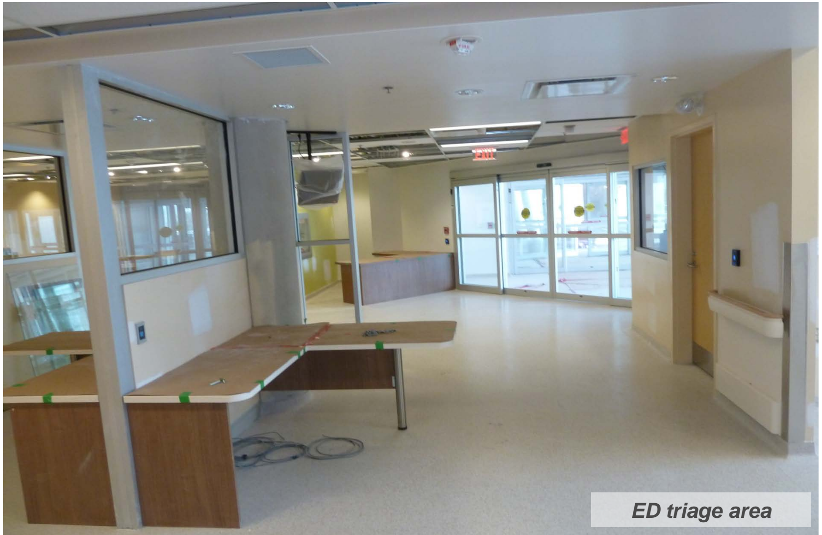
ED triage area