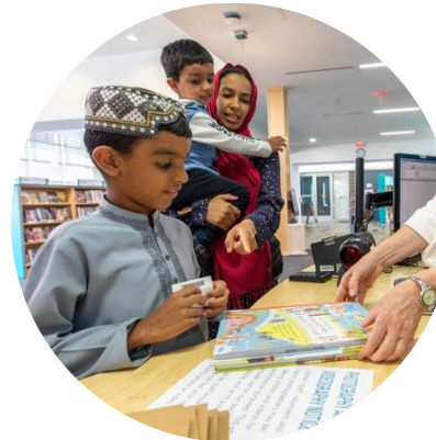
Champion equity, diversity, and inclusion