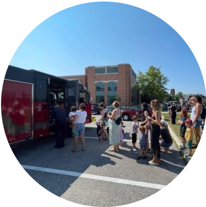
Continue to support a vibrant downtown

We help our community make Connections – with each other, with social services, with amazing collections, with passions, and with opportunities. Through these connections we help support a Thriving and Affordable Community .