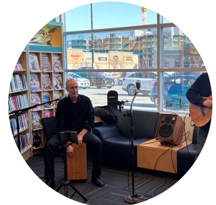
Foster growth in arts and culture