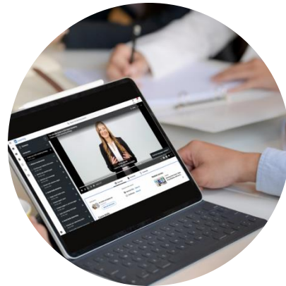
Open for business environment to help encourage job creation