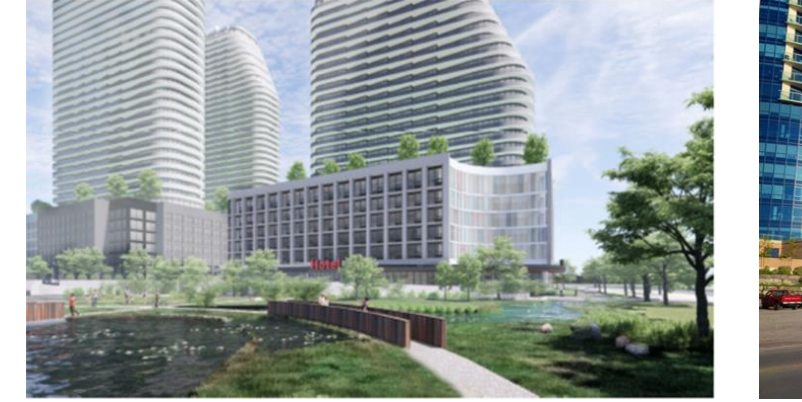
Gary Bell, RPP 365 Codrington Street Barrie, Ontario