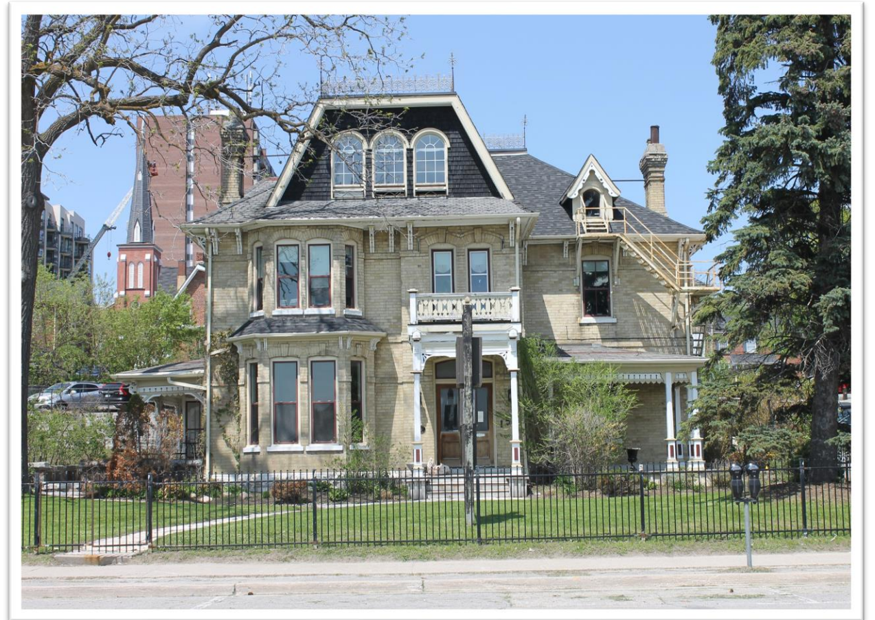
Example: Morton-Turnbul House, designated in 1994 by By-law 94-136