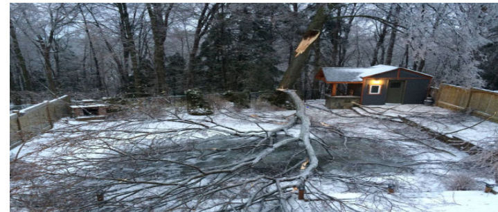
Ice Storm, March, 2016