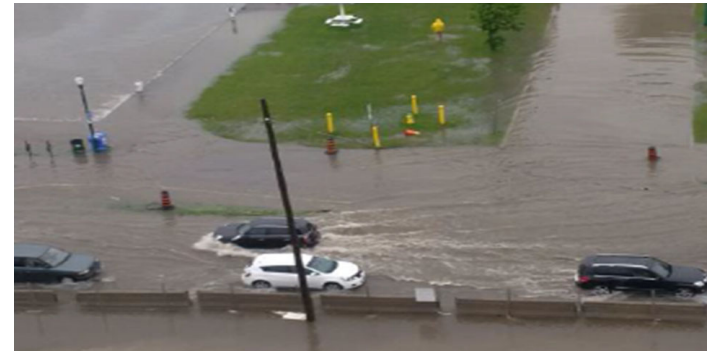
Flooding Lakeshore, June 24, 2014