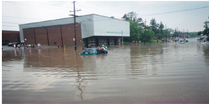
Dunlop at Kidds Creek, June 9, 2005