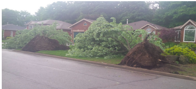
High Winds, June, 2014