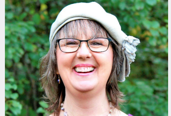
2019: Joie Red