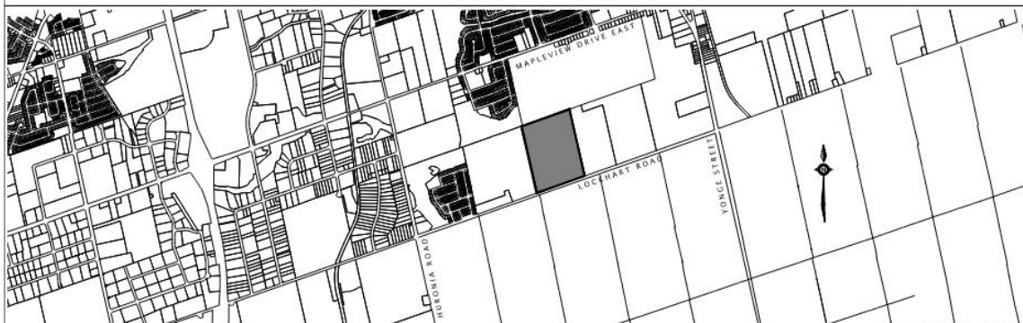
Scale 1:50,000 (8.5x11)