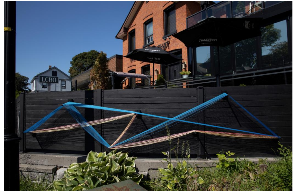
Line Up, Amy Bagshaw, 2021 at The North