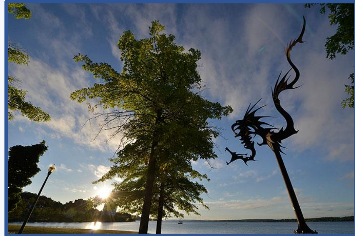
The Sea Serpent , Ron Baird, Installed 2016