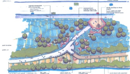
Kempenfelt Park Trail Junction and Node

ROADWAY Trail alignment overlaid with utility map shows major water and sewer lines. Roadbed and utility lines are shown in yellow and red. Roadbed and utility lines are shown in yellow and red. MELSON SQUARE TRAIL NODE Proposed trail node with existing and proposed trail link with Melson Square Park. Provide trail connection to Melson Square Park. MELSON SQUARE TRAIL ACCESS Provide trail to Melson Square between existing water and sewer lines. Provide access with trail crossing at Melson Square at Melson Square Park. Provide trail with existing alignment along with Melson Square Park.