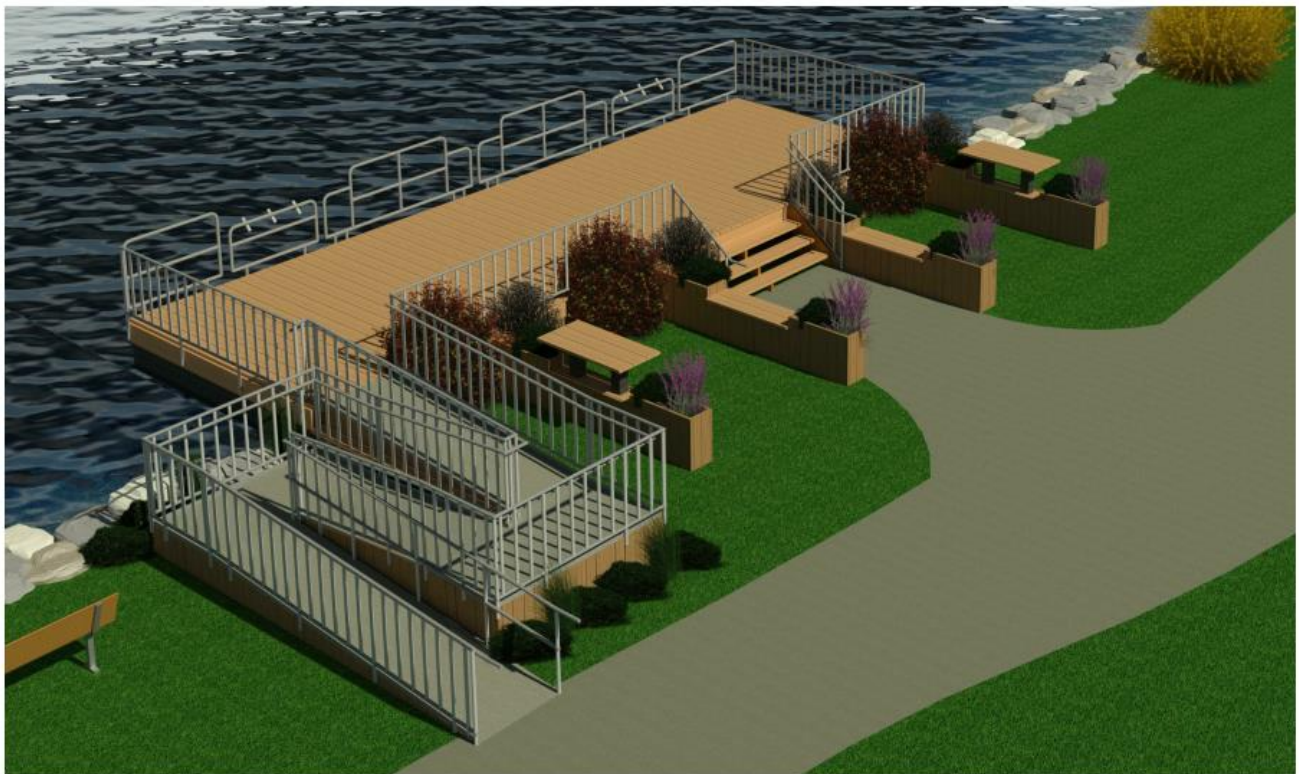
Perspective of Fishing Platform along Shoreline