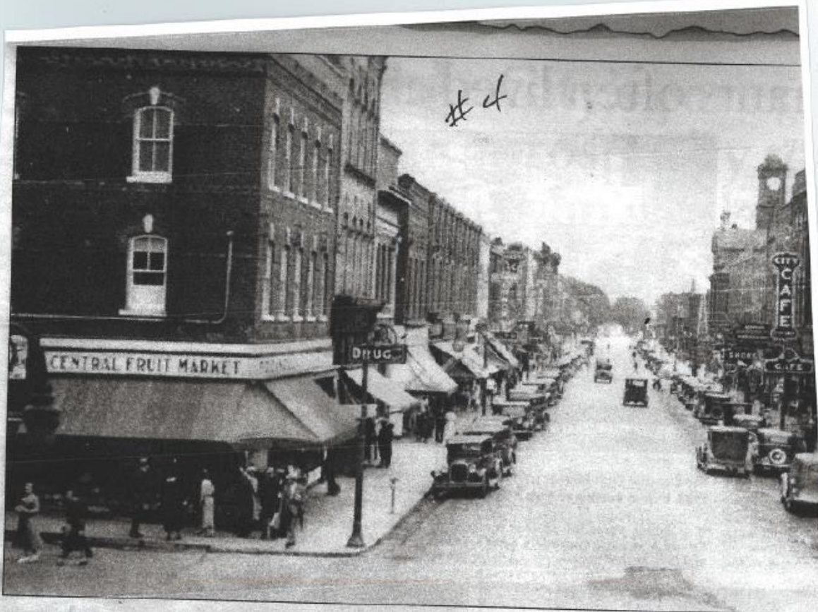
The Cancilla family Central Fruit Market moved to Barrie's Five Points in 1929 from around the corner on Dunlop Street.