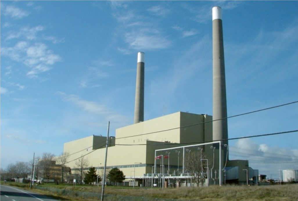
Lennox Power Station near Bath, Ontario, Canada. November 2010.