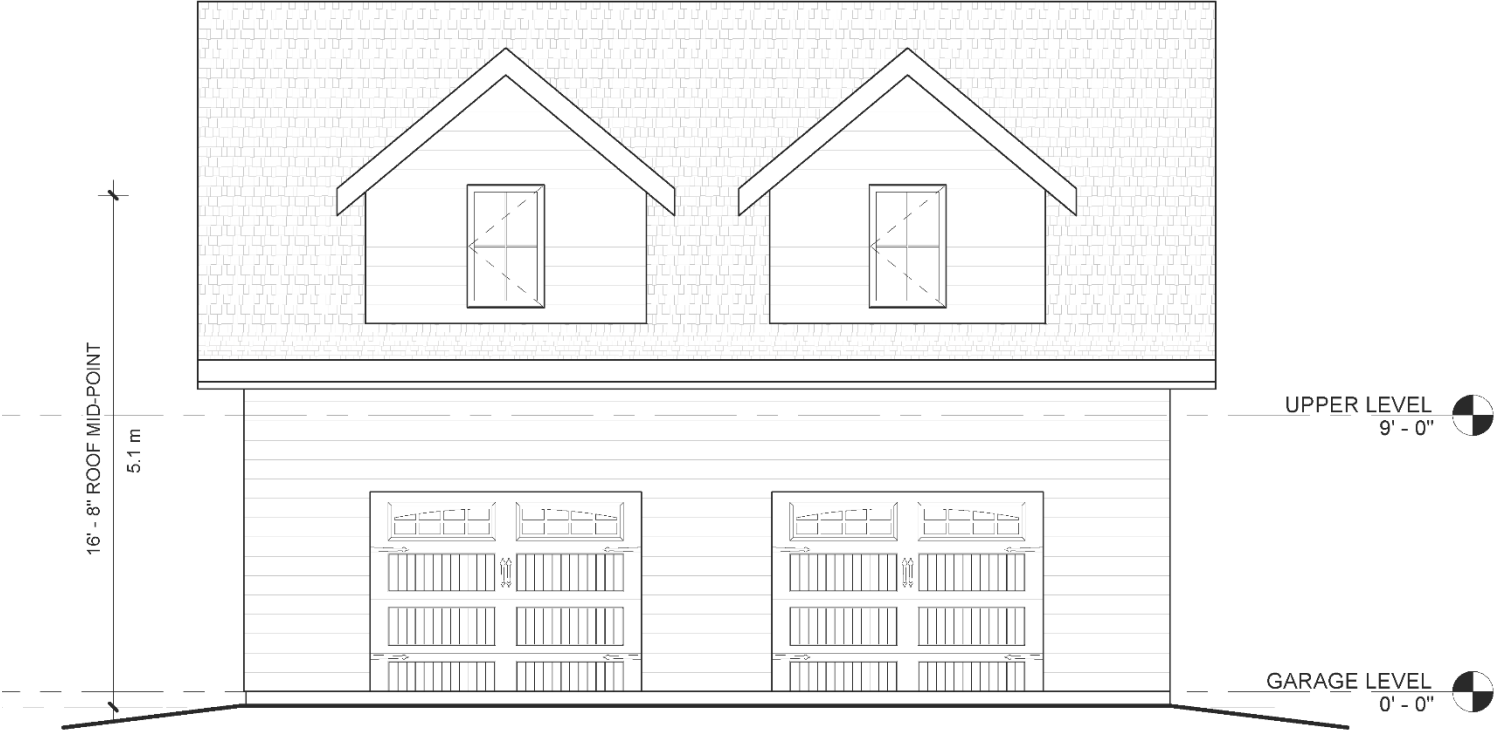
1 NORTH ELEVATION A200 3/16" = 1'-0"