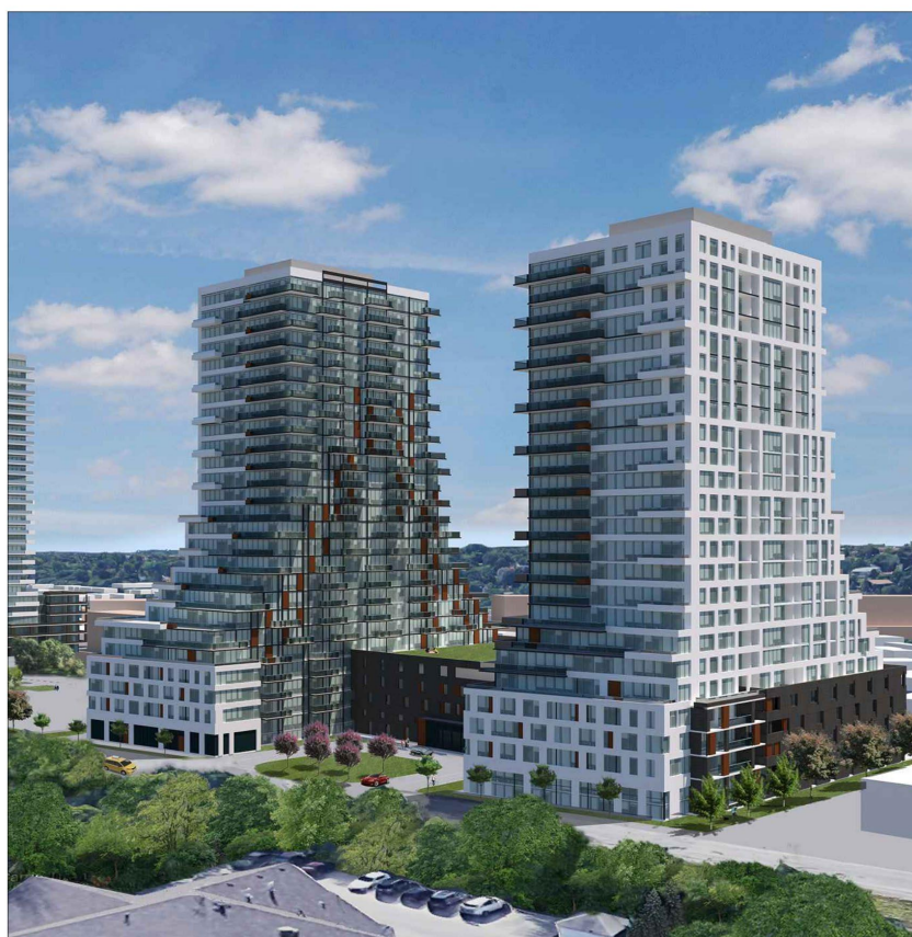
View Looking South East