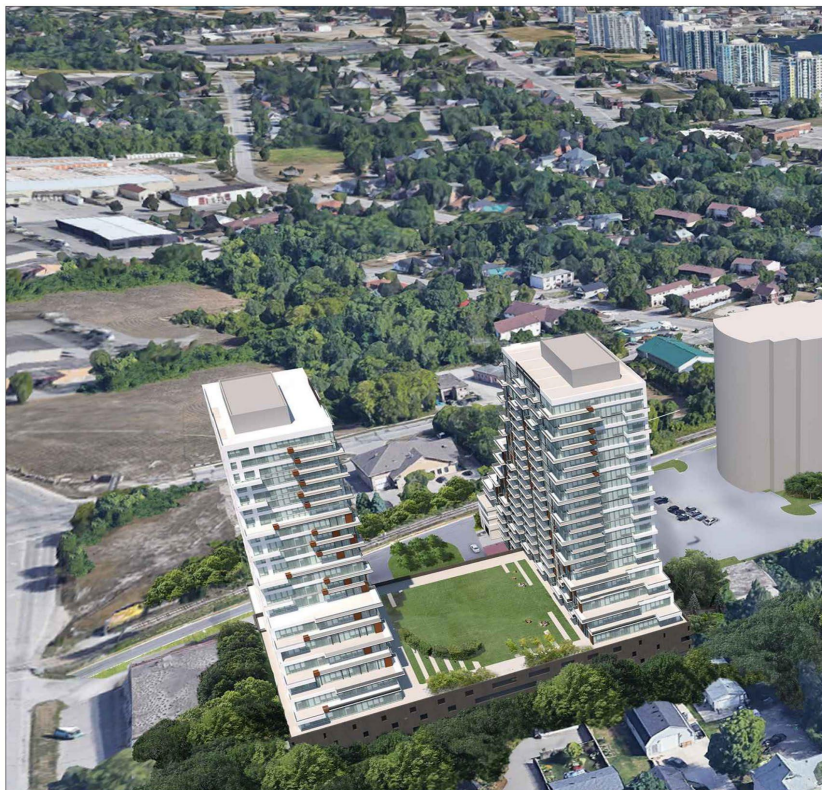
Aerial View Looking North