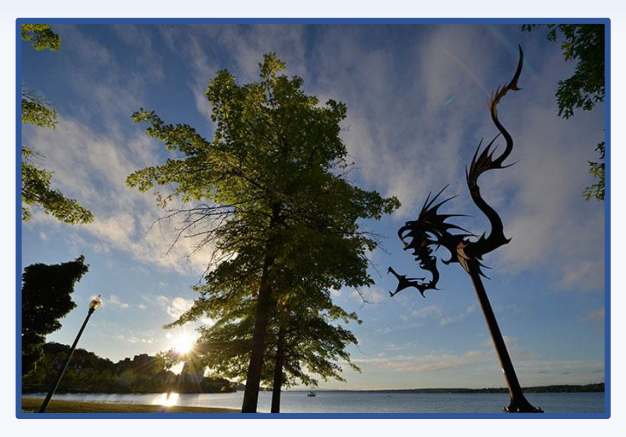
The Sea Serpent, Ron Baird, Installed 2016