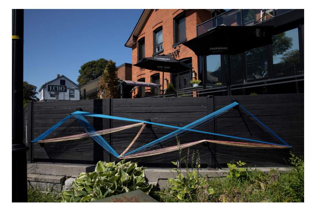
Line Up, Amy Bagshaw, 2021 at The North