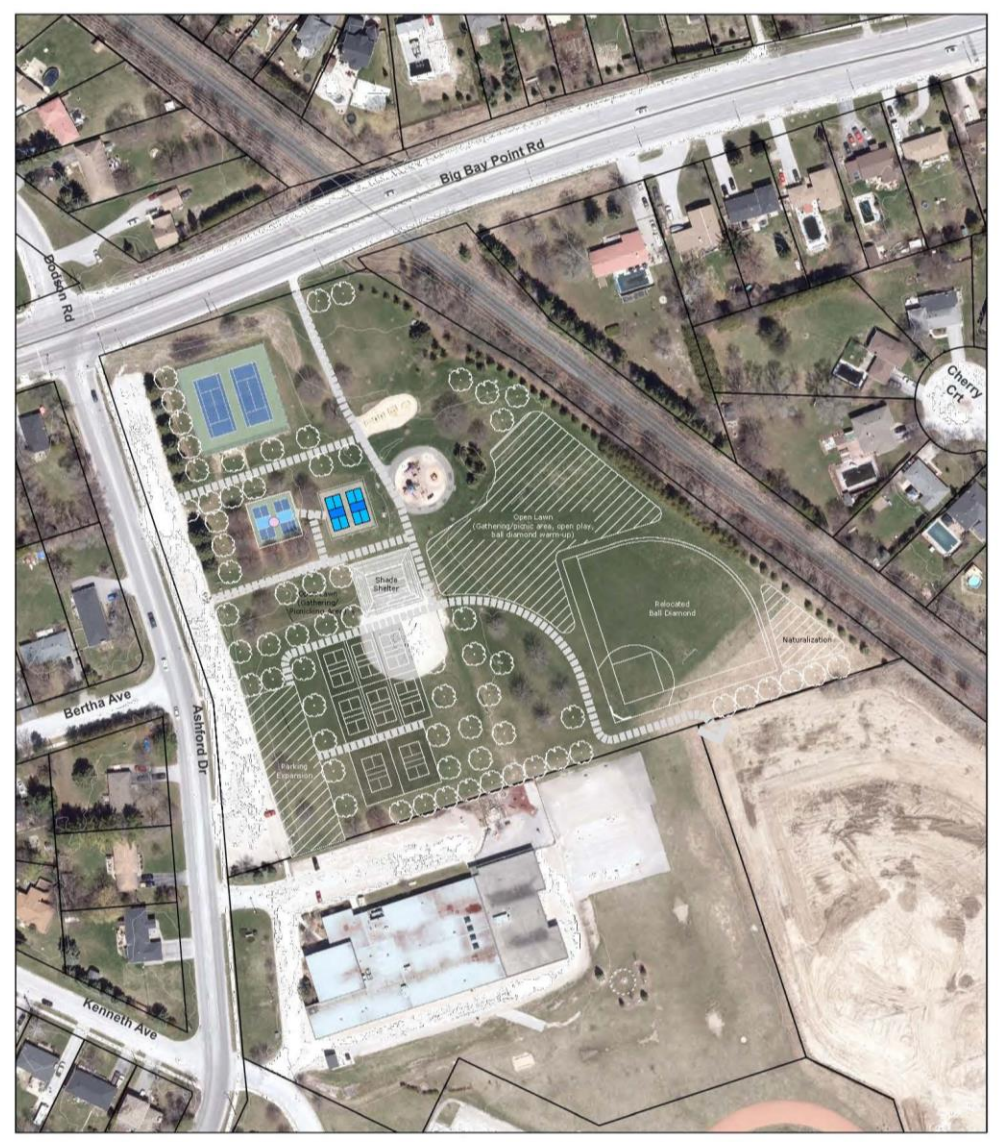
Concept A - 12 Courts, 8 New (Retain and Relocate Ball Diamond)