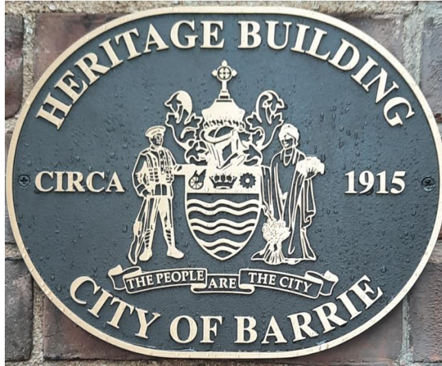
Picture of designated building plaque installed on the MaClaren Arts Centre/Carnegie Library building (37 Mulcaster Street, Barrie)