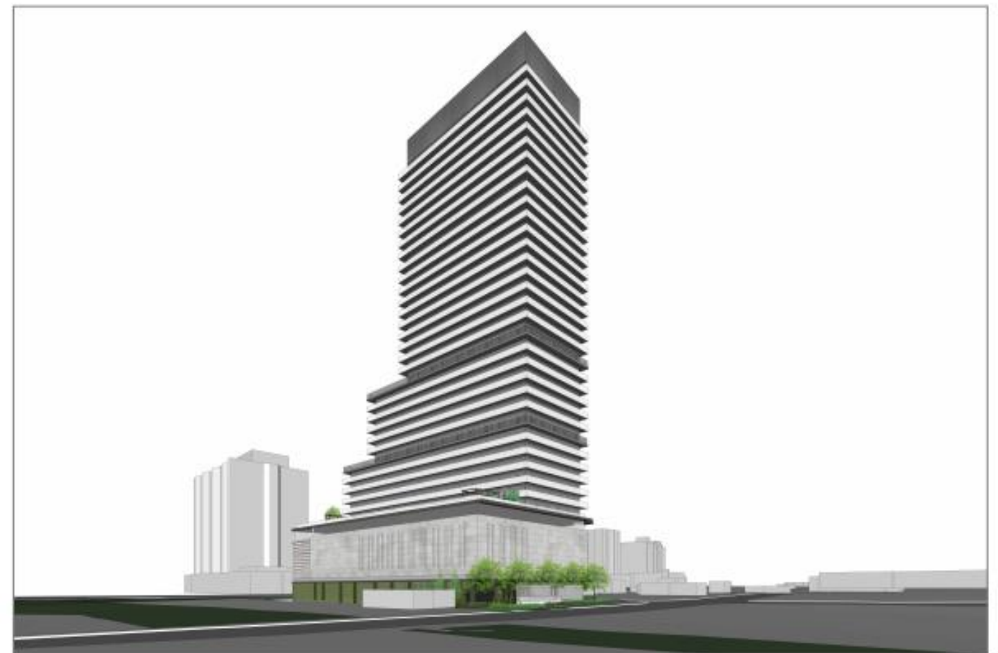
2 NORTH WEST CORNER