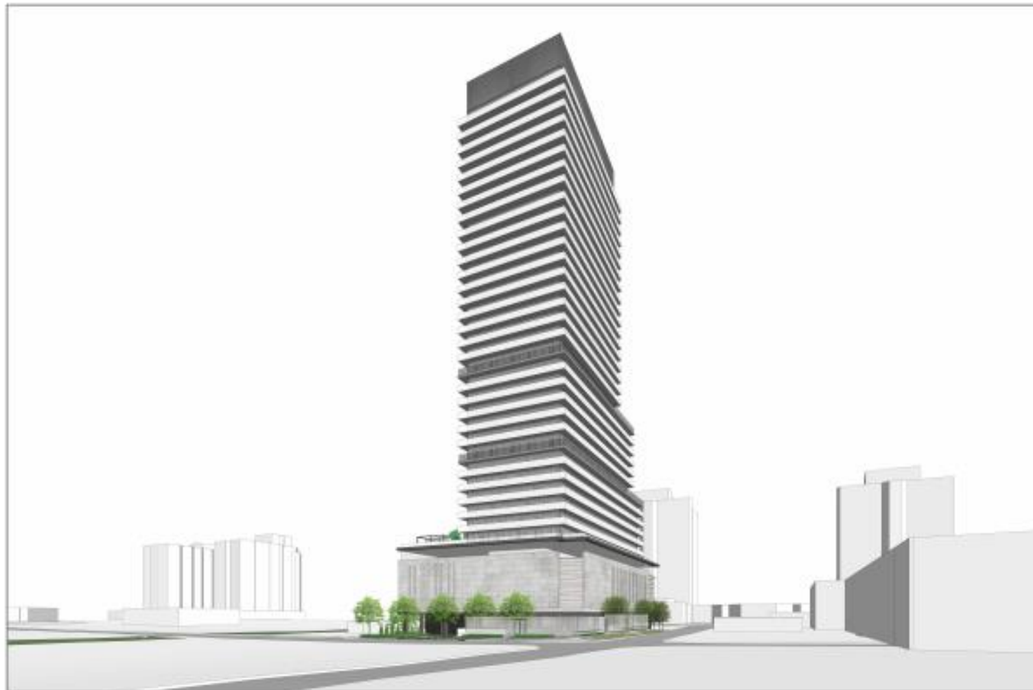
1 SOUTH WEST VIEW AT CORNER OF BRADFORD ST AND VESPRA ST