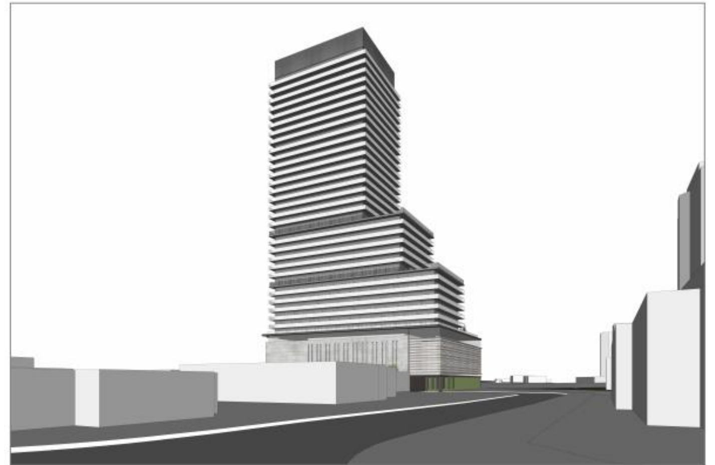
4 SOUTH EAST CORNER