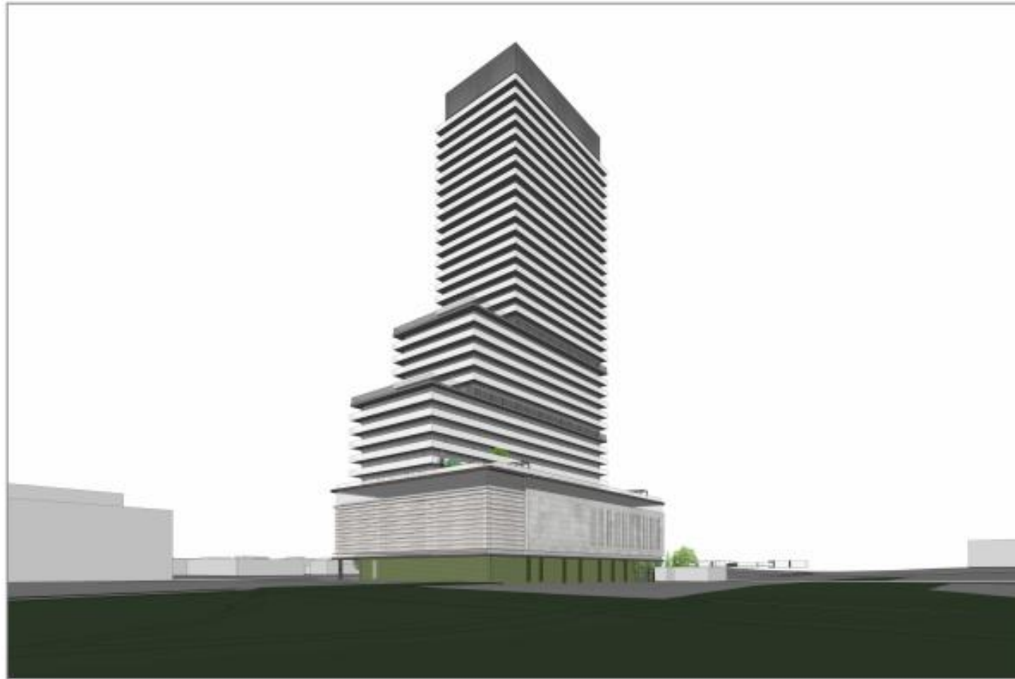
3 NORTH EAST CORNER