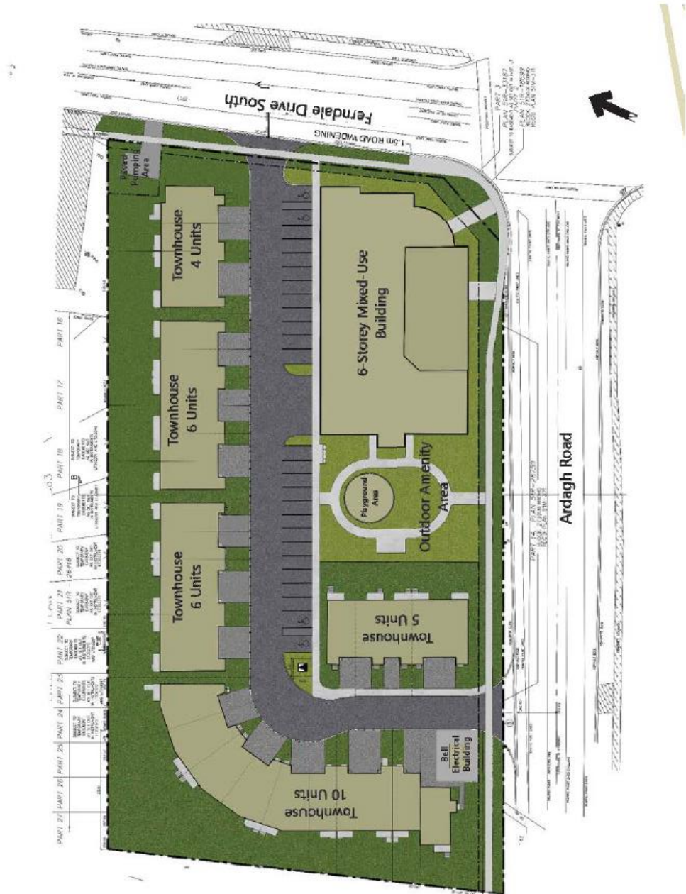
FIGURE 2 – PROPOSED SITE PLAN