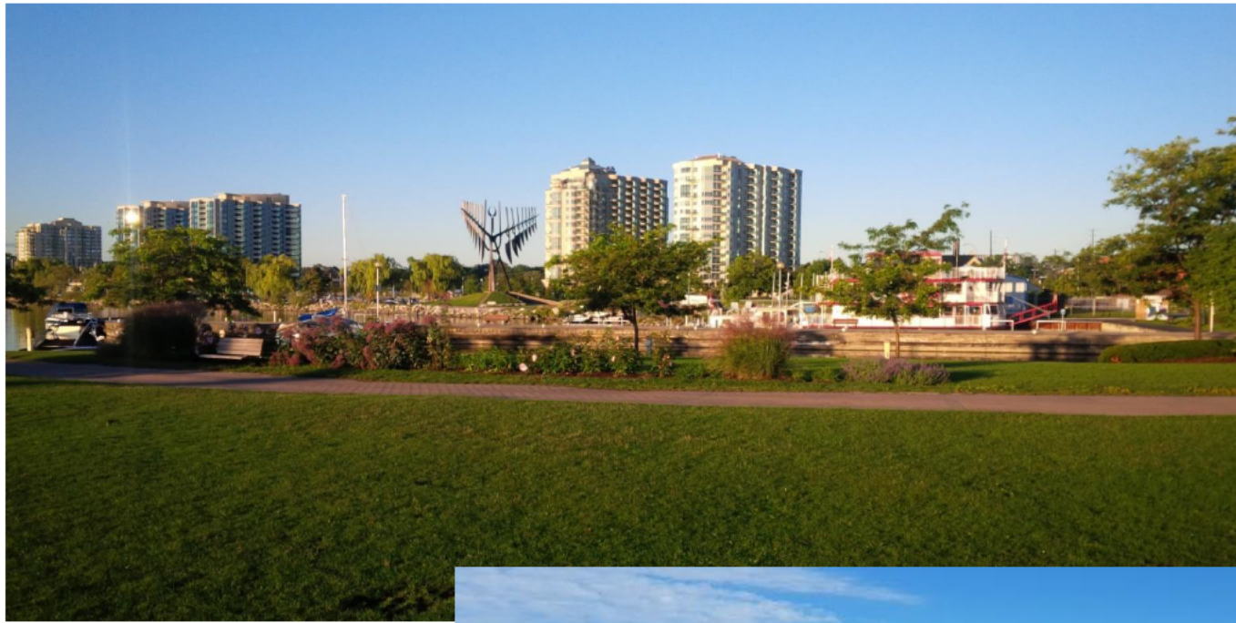
View from Heritage Park