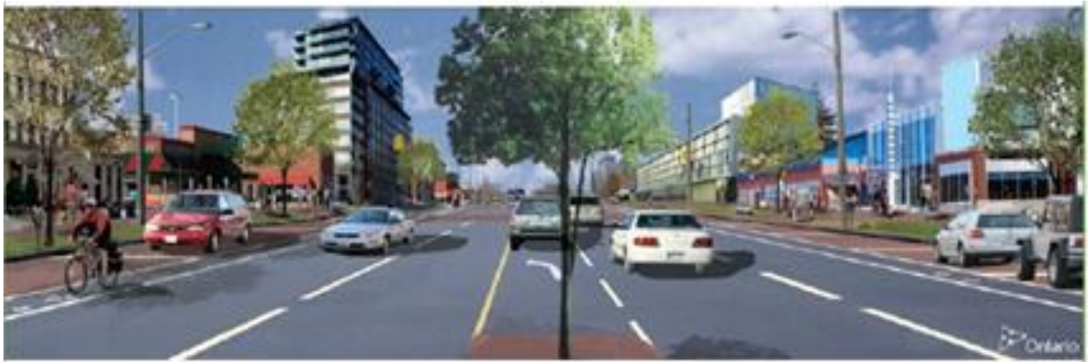
Perspective View Looking North East Along Bradford Street

The desired look for arterial roads such as Bradford Street.